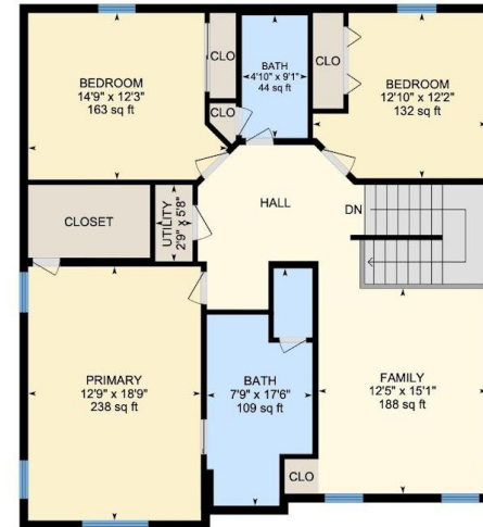
2nd Floor Exterior Area 1327.16 sq ft