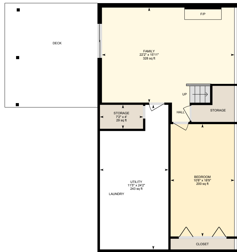
Basement (Below Grade) Finished Area 723.56 sq ft