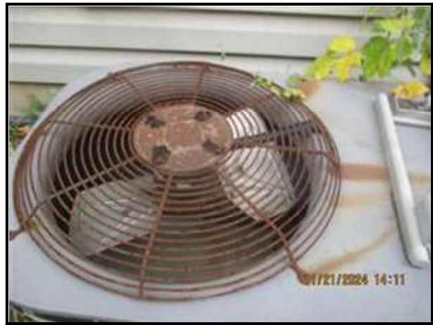
11.1 Picture 2

(2) Maintenance Tip: Vegetation needs to be cleared away so that there is 18" of clear air space for efficient operation.