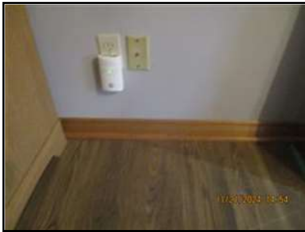
9.4 Picture 3