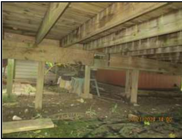
2.4 Picture 3