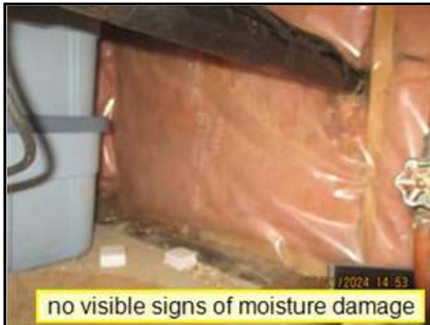
9.4 Picture 1