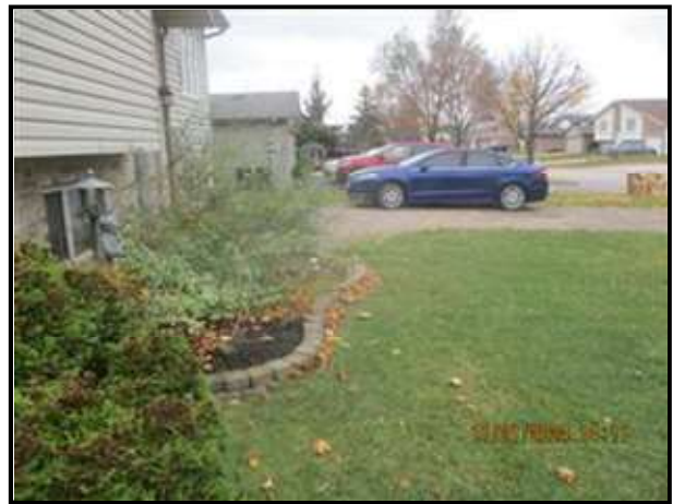
3.2 Picture 2