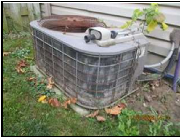
11.1 Picture 1