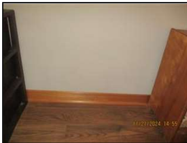
9.4 Picture 7

NOTE: Many at-grade and subgrade water penetration concerns are related to site conditions including inadequate or malfunctioning roof drains, improper foundation or site grading, and blocked drain lines. These and other deficiencies can also cause or contribute to foundation movement or failure, deterioration of wood framing and other house components, and/or wood destroying insects and mold. In many situations, relatively straightforward remedial measures such as extending or diverting downspouts, regrading along the foundation, cleaning drains, or adding a sump pump will help reduce or minimize water penetration concerns. In other cases, the remedy may be much more complex. Any specific recommendations in the report should be promptly addressed; however, be aware that such measures may not represent a complete solution to conditions. Obtain additional recommendations on correcting water penetration concerns from a qualified specialist. If there are indications