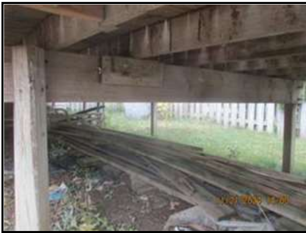
2.4 Picture 1