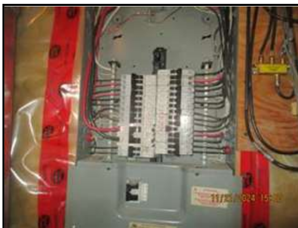
10.3 Picture 1