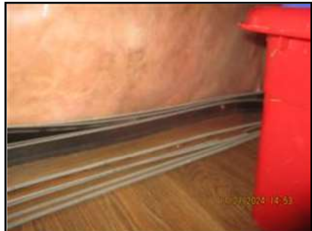
9.4 Picture 2