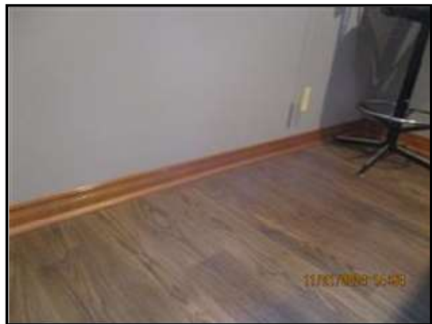
9.4 Picture 6