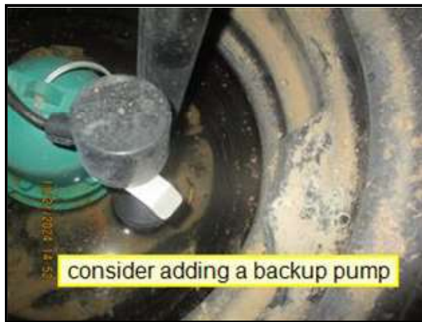
9.2 Picture 1

9.3 There was no backwater valve found at time of inspection. These are devices that are installed in the basement floor to help prevent water backing up into the basement when the streets flood. Installation of these devices in homes with basements has increased dramatically over the past few years as heavy rains and localized flooding have become more prominent. Past history may not be a reliable source of information as these storms can affect large or small areas and future issues cannot be forecasted with any accuracy.