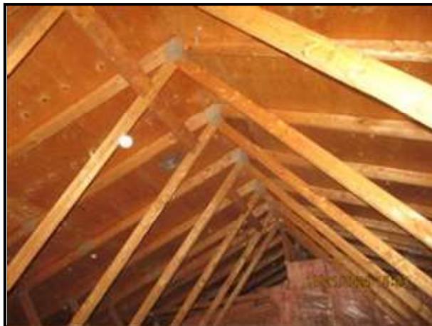
4.0 Picture 1

4.0 Note: Attic access was mostly blocked by shelving and storage. Inspection was limited to the areas visible from near the opening and reaching in for pictures. To fully evaluate the attic area, the shelving/storage would need to be removed.