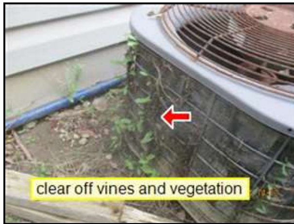
11.1 Picture 3

(2) Maintenance Tip: Vegetation needs to be cleared away so that there is 18" of clear air space for efficient operation.