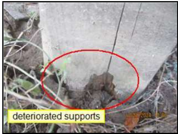
2.4 Picture 2