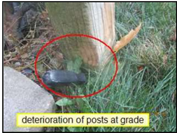
2.4 Picture 4

2.6 Incomplete railings. A pool has been recently removed and a railing should be installed where missing for improved safety.