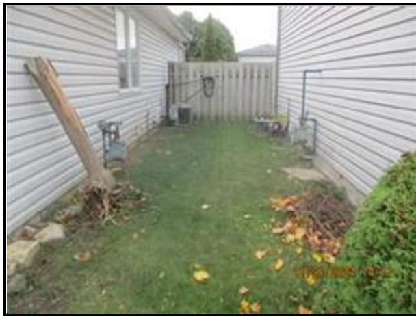
3.2 Picture 1

3.2 Generally flat grading with some low spots noted near the foundation, especially where the backfill has settled. This condition does not allow water run-off and contributes to ponding that can cause structural and/or interior water infiltration problems. Deficiencies must be corrected and suitable drainage conditions must be maintained in order to prevent problems.