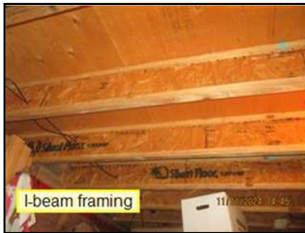
8.2 Picture 1