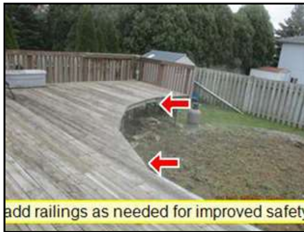
2.6 Picture 1

2.6 Incomplete railings. A pool has been recently removed and a railing should be installed where missing for improved safety.