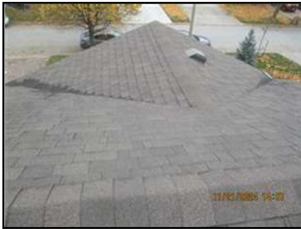
1.0 Picture 5