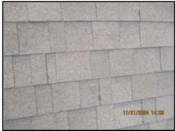
1.0 Picture 4