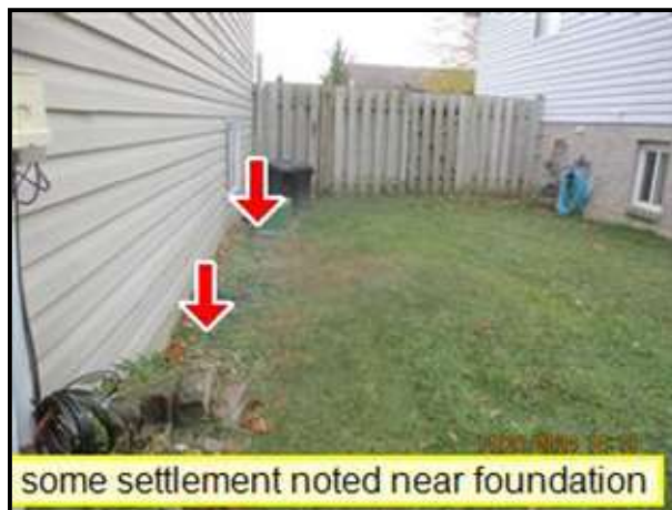
3.2 Picture 3

3.3 Overall grading slopes well away from the structure.