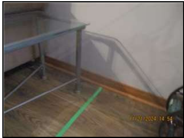
9.4 Picture 4