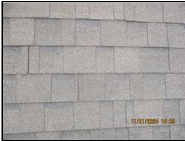
1.0 Picture 3