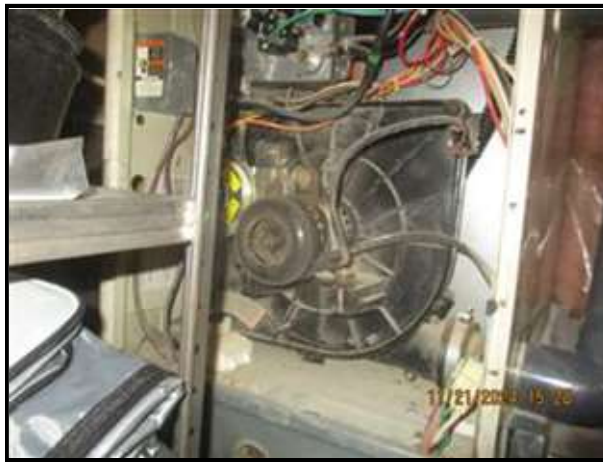
12.0 Picture 1

12.4 Note: The venting material for high efficient furnaces recently changed to a new grade of plastic piping (System 636). Every new furnace will need to have this material installed. As long as there is no defect in the current material, nothing will need to be done until the furnace is replaced.