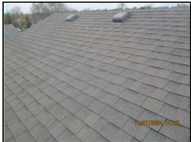
1.0 Picture 2