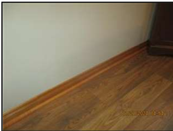
9.4 Picture 5