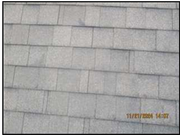
1.0 Picture 6

NOTE: All roofs have a finite life and will require replacement at some point. In the interim, the seals at all roof penetrations and flashings, and the watertightness of rooftop elements, should be checked periodically and repaired or maintained as required. Any roof defect can result in leakage, mold, and subsequent damage. Conditions such as hail damage or manufacturing defects or whether the proper nailing methods or underlayment were used are not readily detectible during a home inspection. Gutters (eavestroughs) and downspouts (leaders) will require regular cleaning and maintenance. All chimneys and vents should be checked periodically. In general, fascia and soffit areas are not readily accessible for inspection; these components are prone to decay, insect, and pest damage, particularly with roof or gutter leakage. If any roof deficiencies are reported, a qualified roofer or the appropriate specialist should be contacted to determine what remedial action is required. If the roof inspection was restricted or limited due to roof height, weather conditions, or other factors, arrangements should be made to have the roof inspected by a qualified roofer, particularly if the roofing is older or its age is unknown.