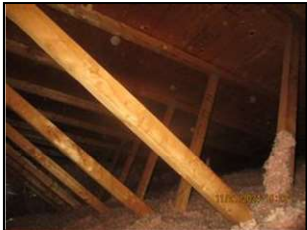
4.0 Picture 2