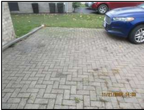
3.1 Picture 1