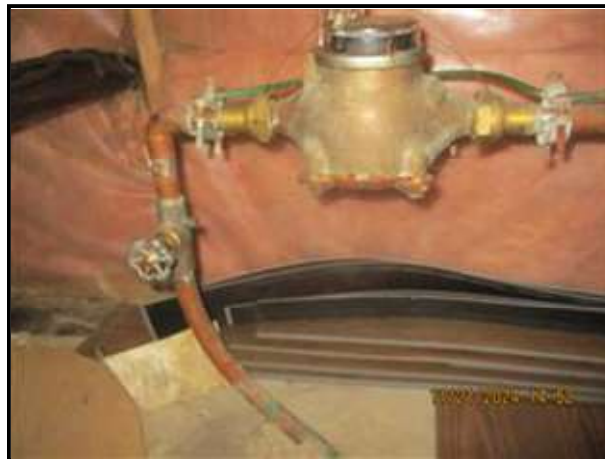
13.0 Picture 1

NOTE: Recommend obtaining documentation/verification on the type water supply and waste disposal systems. If private onsite water and/or sewage systems are reported/determined to exist, independent evaluation (including water analyses) is recommended. Plumbing systems are subject to unpredictable change, particularly as they age (e.g., leaks may develop, water flow may drop, or drains may become blocked). Plumbing system leakage can cause or contribute to mold and/or structural concerns. Some piping may be subject to premature failure due to inherent material deficiencies or water quality problems, (e.g., polybutylene pipe may leak at joints, copper water pipe may corrode due to acidic water, or old galvanized pipe may clog due to water mineral content). Periodic cleaning of drain lines, including underground pipes will be necessary. Periodic water