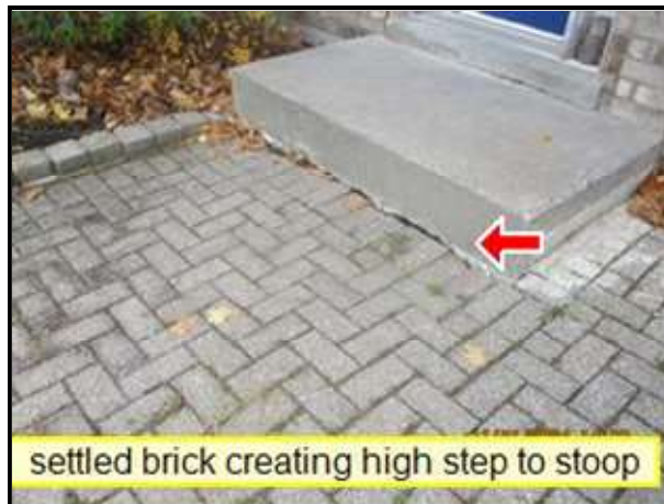
3.0 Picture 1

3.0 Settlement of the walkway has created a large step onto the front stoop. Correction to the walk, such as removing, regrading and replacing nearby brick will return the step to normal height.