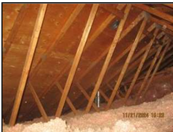
4.0 Picture 3

NOTE: Attic heat, moisture levels, and ventilation conditions are subject to change. All attics should be monitored for any leakage, moisture buildup or other concerns. Detrimental conditions should be corrected and ventilation provisions should be improved where needed. Any comments on insulation levels and/or materials are for general information purposes only and were not verified. Some insulation products may contain or release potentially hazardous or irritating materials--avoid disturbing. A complete check of the attic should be made prior to closing after non-permanent limitations/obstructions are removed. Any stains/leaks may be due to numerous factors; verification of the cause or status of all condition is not possible. Leakage can lead to mold concerns and structural damage. If concerns exist, recommend evaluation by a qualified roofer or the appropriate specialist.