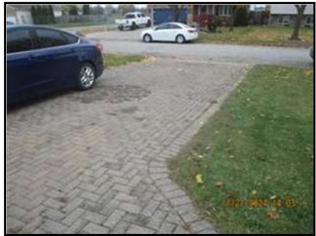
3.1 Picture 2

3.2 Generally flat grading with some low spots noted near the foundation, especially where the backfill has settled. This condition does not allow water run-off and contributes to ponding that can cause structural and/or interior water infiltration problems. Deficiencies must be corrected and suitable drainage conditions must be maintained in order to prevent problems.