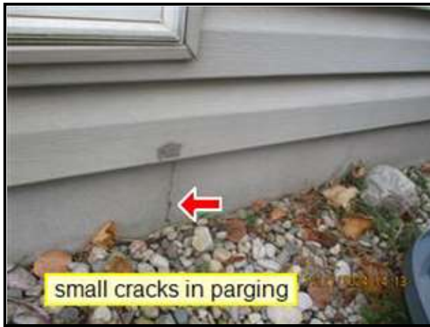
2.7 Picture 1