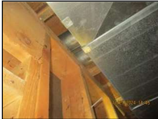
8.3 Picture 1

NOTE: All foundations are subject to settlement and movement. Improper/inadequate grading or drainage can cause or contribute to foundation damage and/or failure and water penetration. Deficiencies must be corrected and proper grading/drainage conditions must be maintained to minimize foundation and water penetration concerns. If significant foundation movement or cracking is indicated, evaluation by an engineer or qualified foundation specialist is recommended. All wood components are subject to decay and insect damage; a wood-destroying insect inspection is recommended. Should decay and/or insect infestation or damage be reported, a full inspection should be made by a qualified specialist to determine the extent and remedial measures required. Insulation and other materials obstructing structural components are not normally moved or disturbed during a home inspection. Obstructed elements or inaccessible areas should be inspected when limiting conditions are removed. In high-wind or high-risk seismic areas, it would be advisable to arrange for an inspection of the house by a qualified specialist to determine whether applicable construction requirements are met or damage exists. Should you seek advice or wish to arrange a new inspection for elements not visible during the inspection, please contact the Inspection Company.