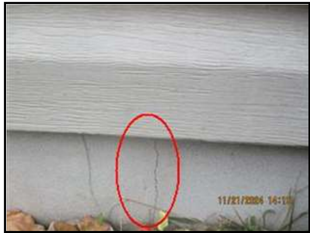
2.7 Picture 2

2.9 Although outdoor faucets will soon need to be shut off to prevent freezing of the pipes and internal water damage.