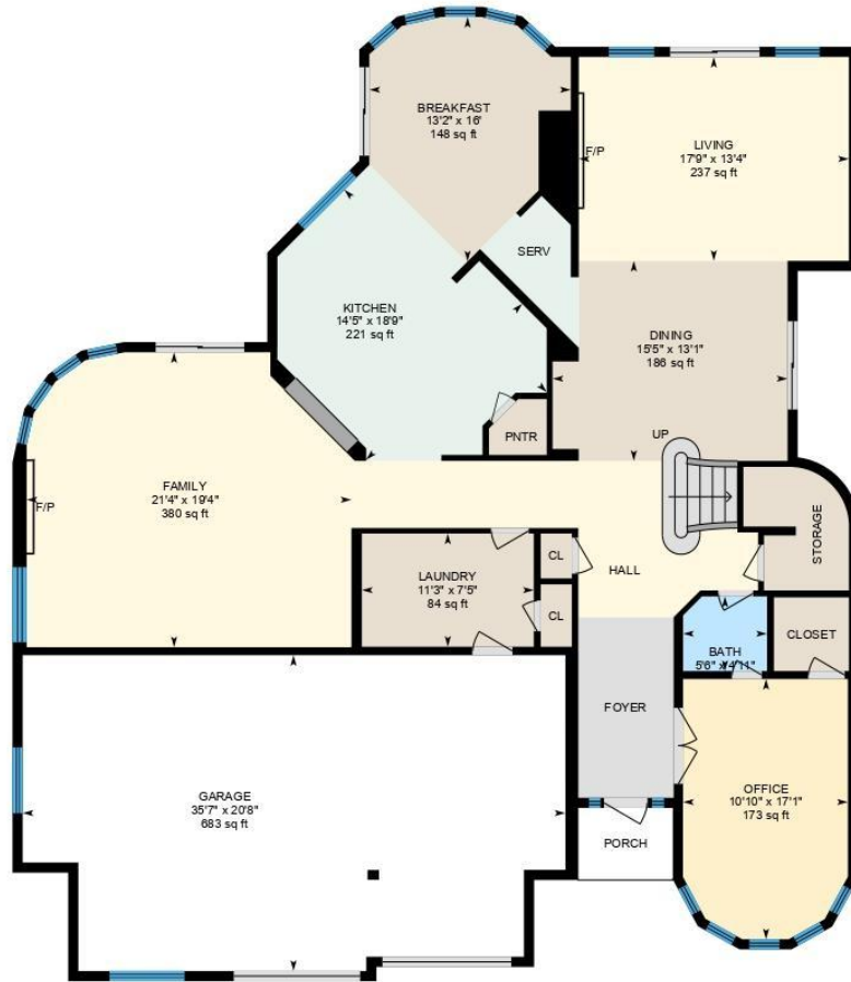
1st Floor Finished Area 2071.42 sq ft