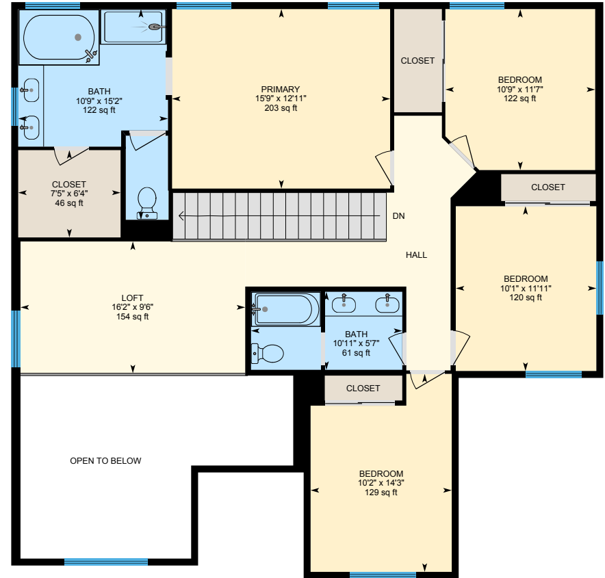
2nd Floor Finished Area 1315.39 sq ft