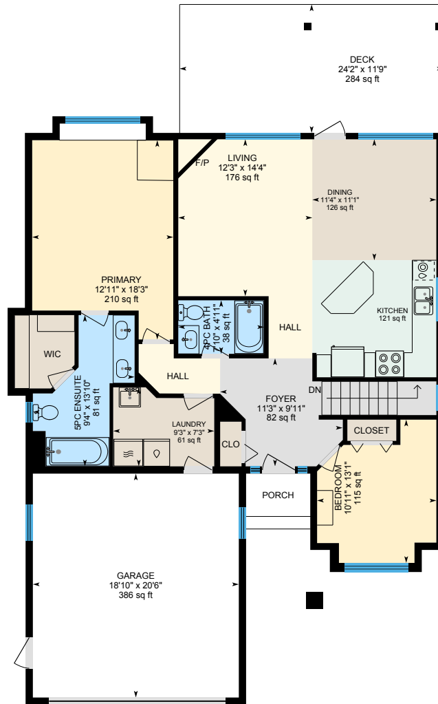
Main Floor(9ft) Exterior Area 1310.06 sq ft

Main Building: Total Exterior Area Above Grade 2548.16 sq ft