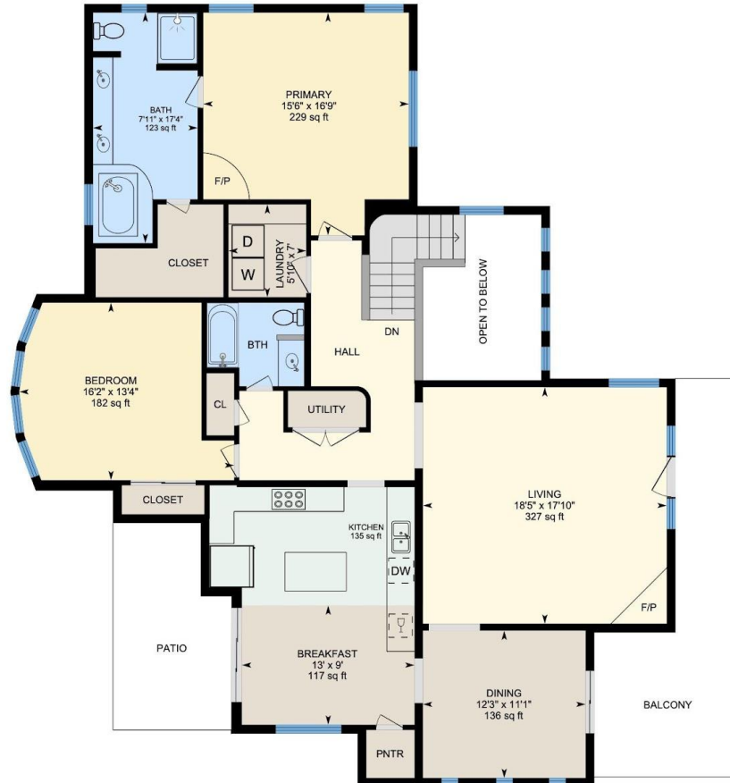
2nd Floor Exterior Area 1859.45 sq ft