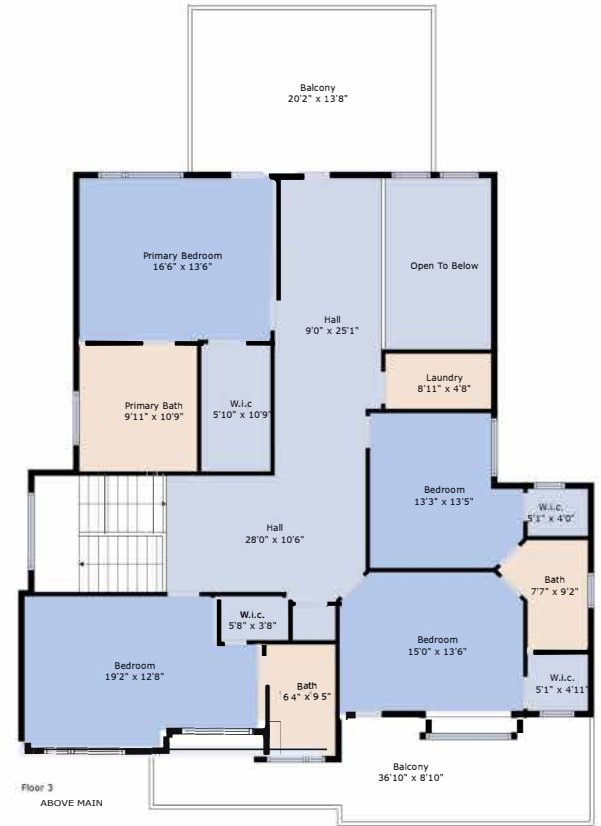
Floor 3 ABOVE MAIN

Estimated areas BELOW MAIN 1242 sq. ft MAIN 1697 sq. ft ABOVE MAIN 1825 sq. ft TOTAL 4767 ft