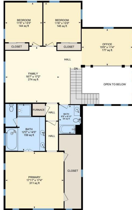
2nd Floor Exterior Area 1783.62 sq ft