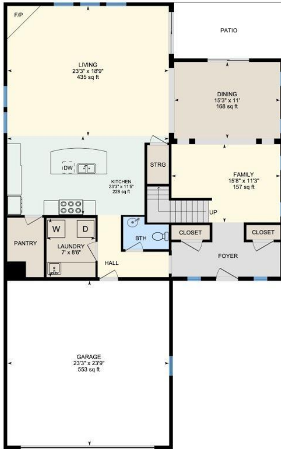
1st Floor Exterior Area 1483.66 sq ft