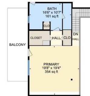
Loft Exterior Area 763.11 sq ft