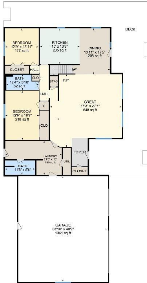
Main Floor Exterior Area 2304.64 sq ft

Main Building: Total Exterior Area Above Grade 3067.75 sq ft