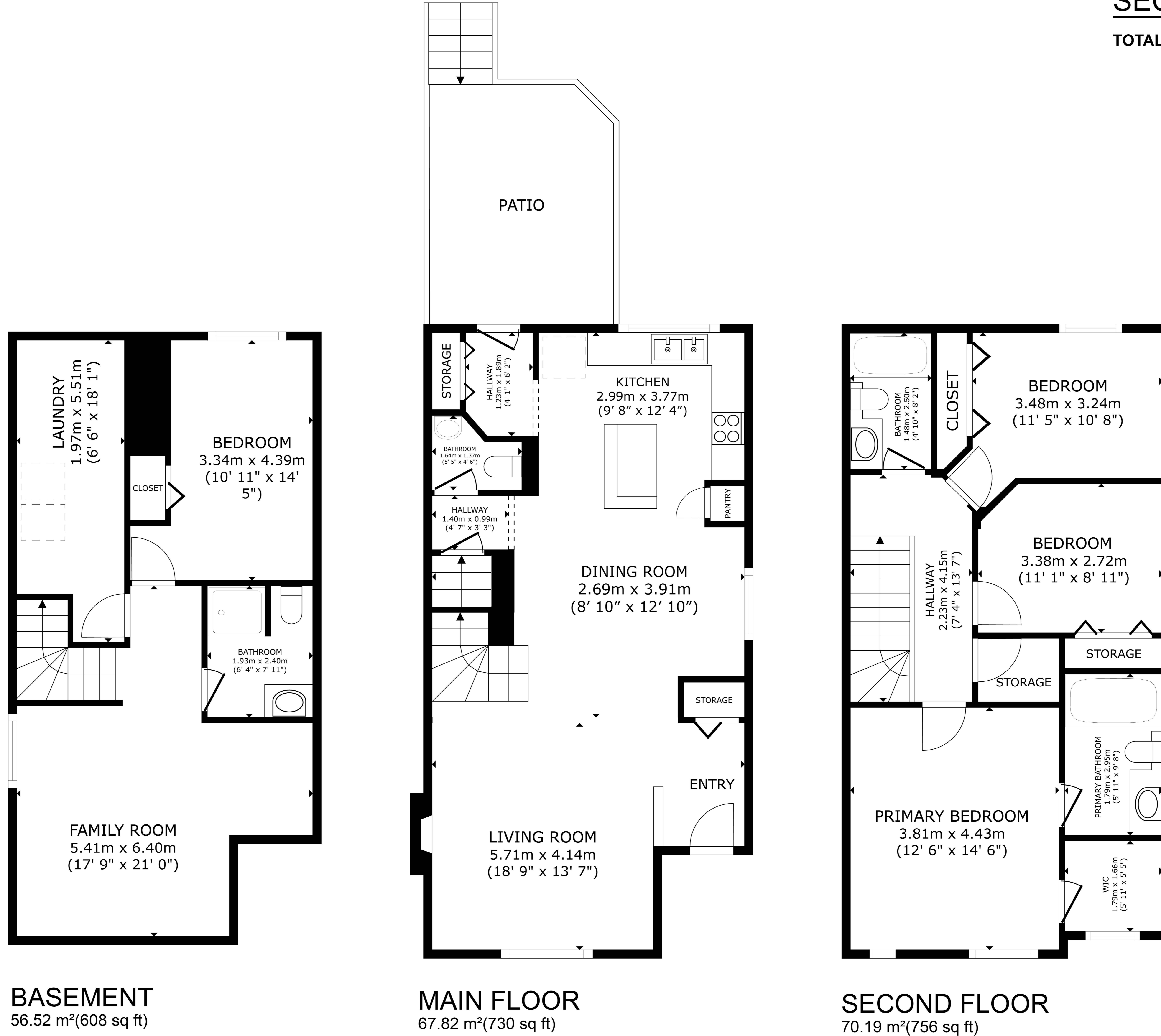
BASEMENT 56.52 m 2 (608 sq ft)

MAIN 730 SQ.FT. SECOND 756 SQ.FT. TOTAL RMS 1486 SQ.FT.