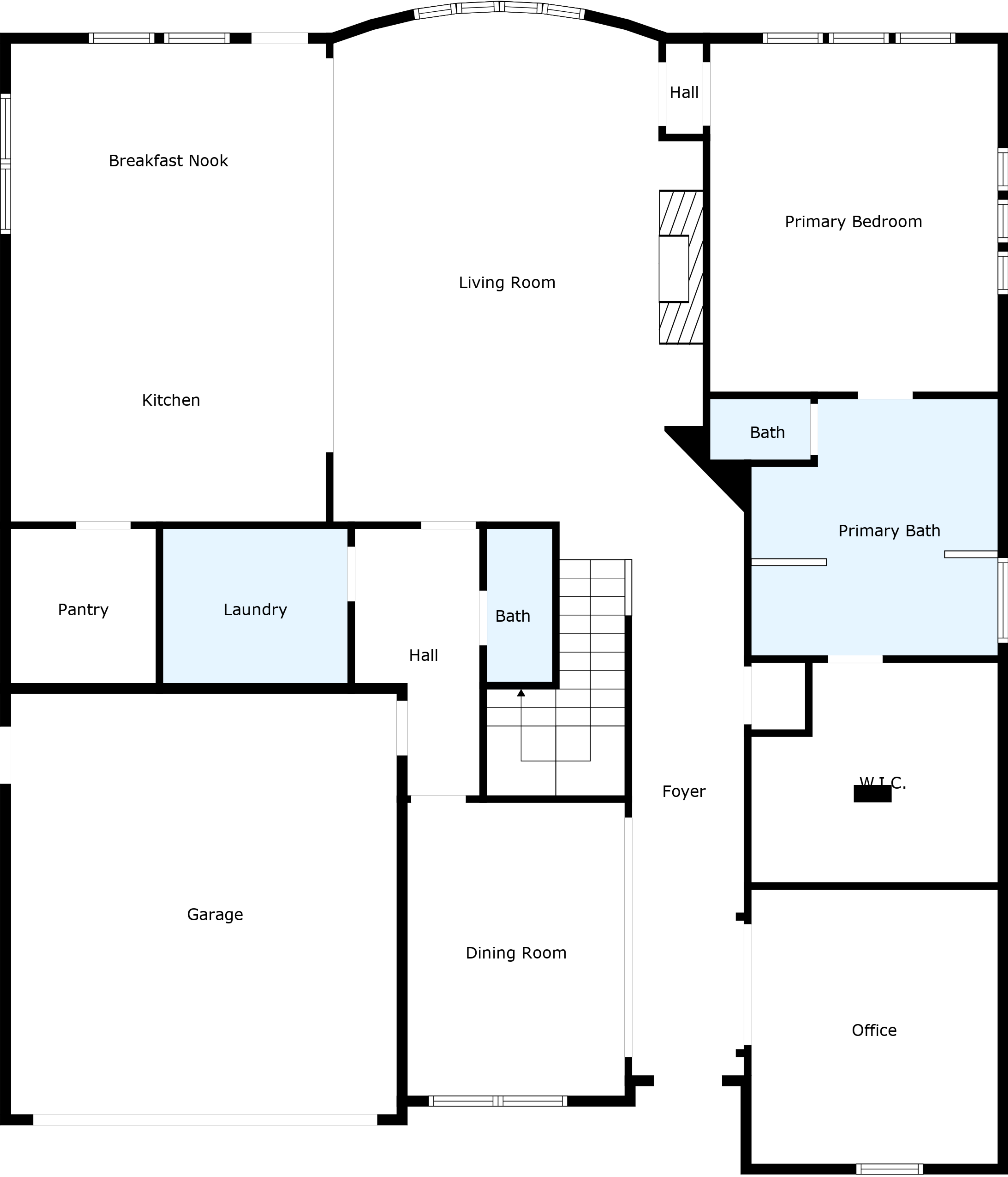
Measurements Are Approximate