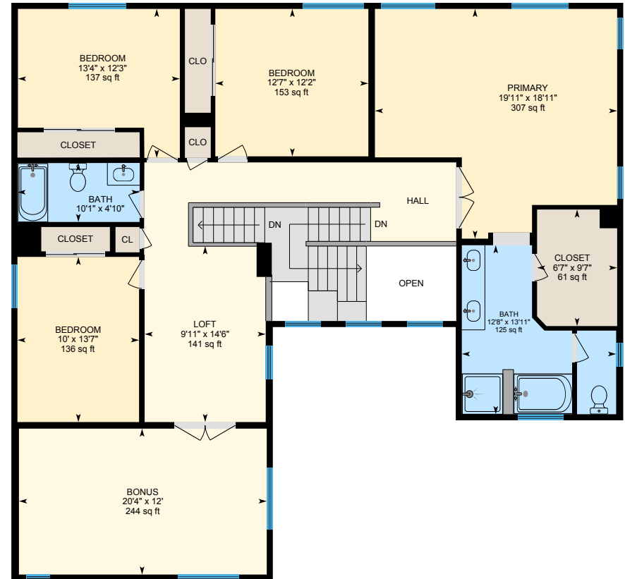
2nd Floor Finished Area 1834.89 sq ft