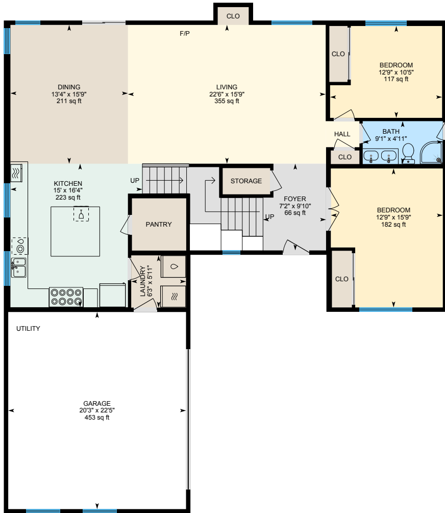
1st Floor Finished Area 1547.88 sq ft

Main Building: Above Grade Finished Area 3382.78 sq ft