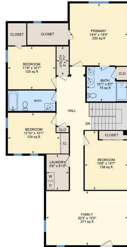
2nd Floor Exterior Area 1579.90 sq ft