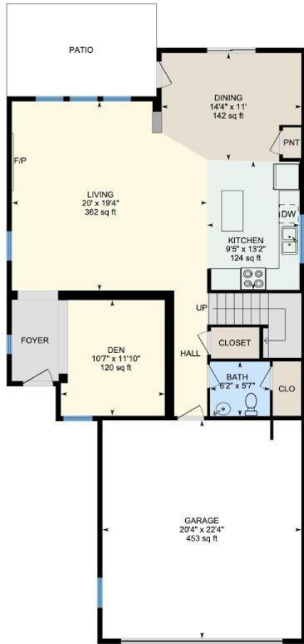
1st Floor Exterior Area 1076.07 sq ft