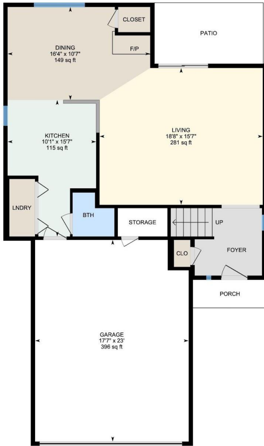
1st Floor Exterior Area 758.59 sq ft

Main Building: Total Exterior Area Above Grade 1724.53 sq ft