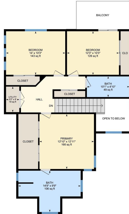
2nd Floor Exterior Area 965.94 sq ft