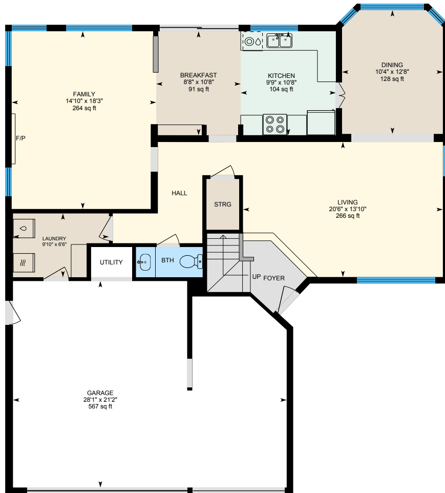
1st Floor Finished Area 1230.84 sq ft

Main Building: Above Grade Finished Area 2383.67 sq ft