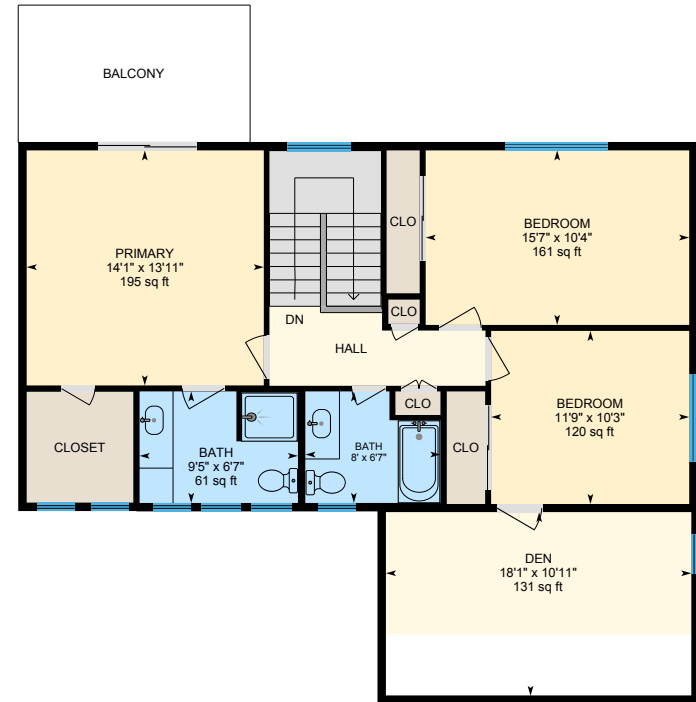
2nd Floor Finished Area 1018.69 sq ft