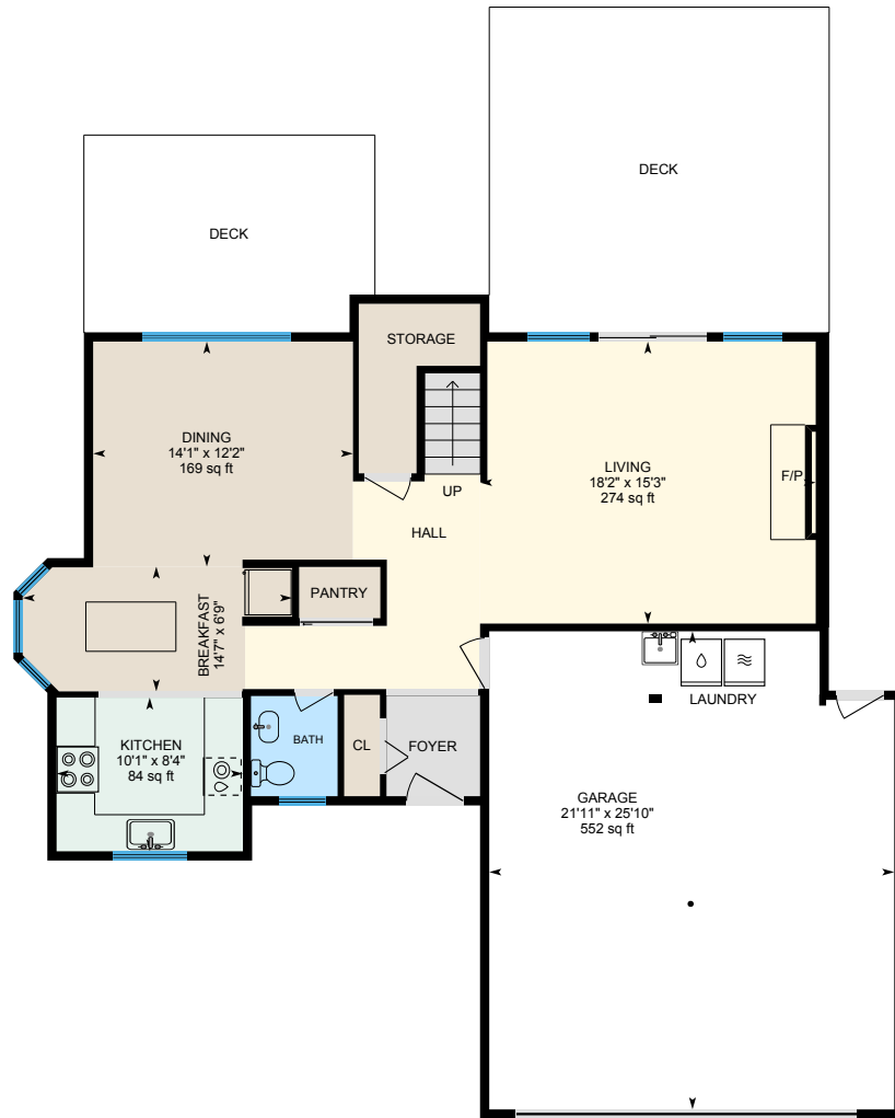
1st Floor Finished Area 939.77 sq ft

Main Building: Above Grade Finished Area 1958.46 sq ft