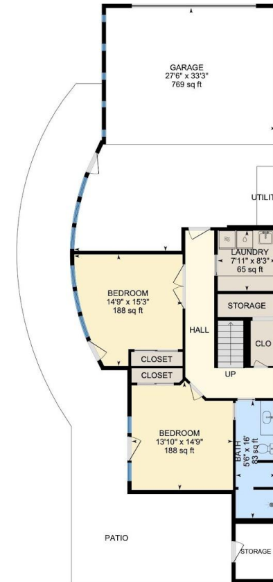
Lower Level (Below Grade) Exterior Area 883.80 sq ft