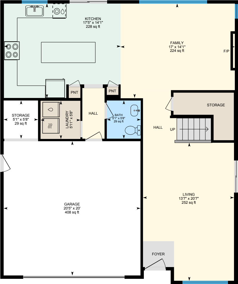
1st Floor Finished Area 1006.75 sq ft

Main Building: Above Grade Finished Area 2178.76 sq ft