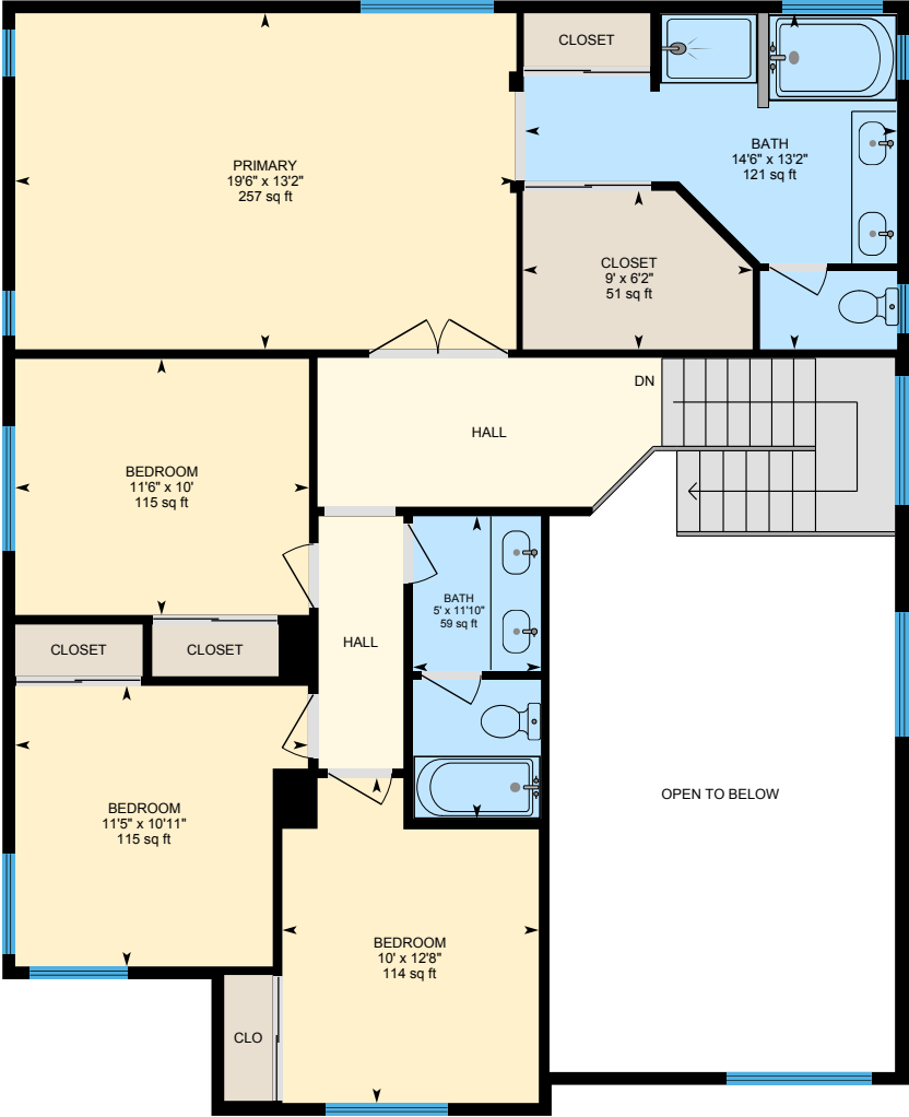
2nd Floor Finished Area 1172.01 sq ft