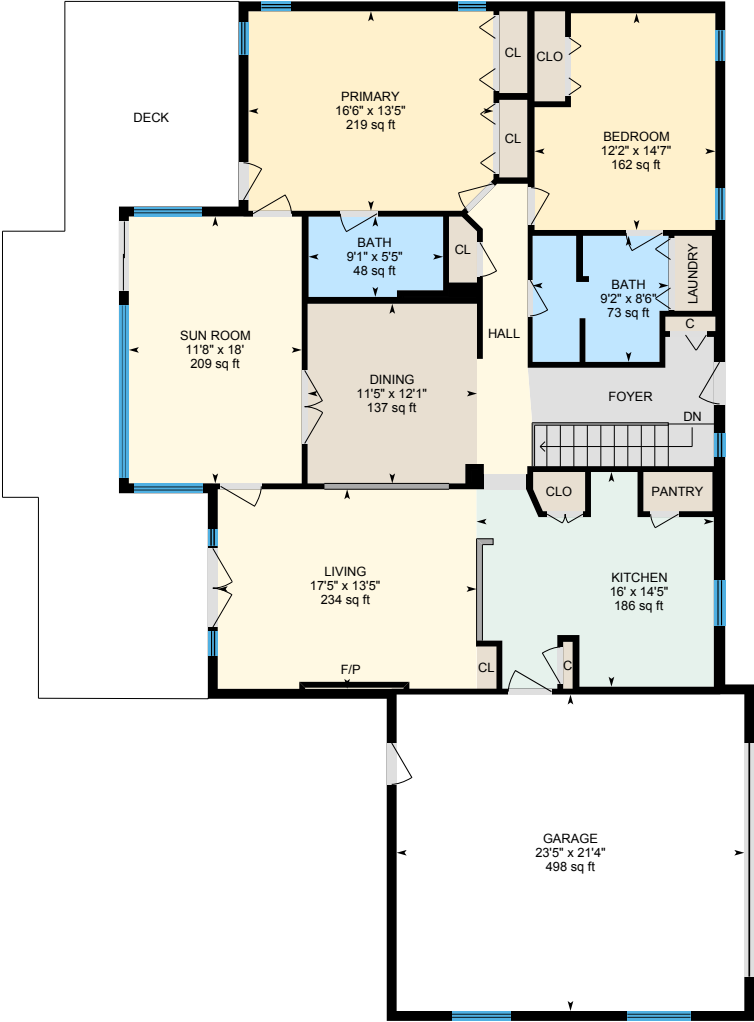
Main Floor Finished Area 1708.66 sq ft

Main Building: Above Grade Finished Area 1708.66 sq ft