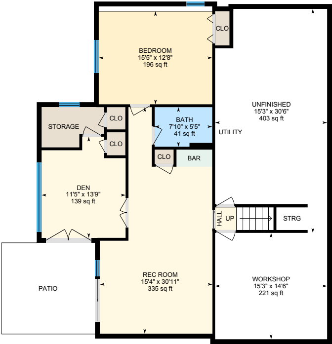
Basement (Below Grade) Finished Area 920.06 sq ft