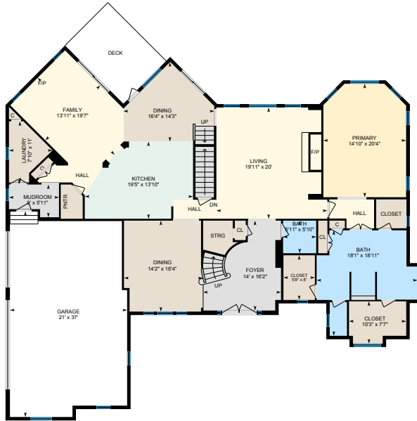
Main Floor Finished Area 2683.66 sq ft

Main Building: Above Grade Finished Area 4363.90 sq ft