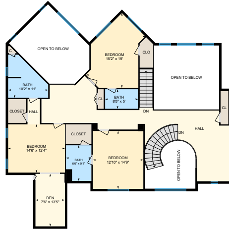
2nd Floor Finished Area 1680.24 sq ft