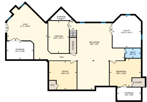
Basement (Below Grade) Finished Area 1998.49 sq ft