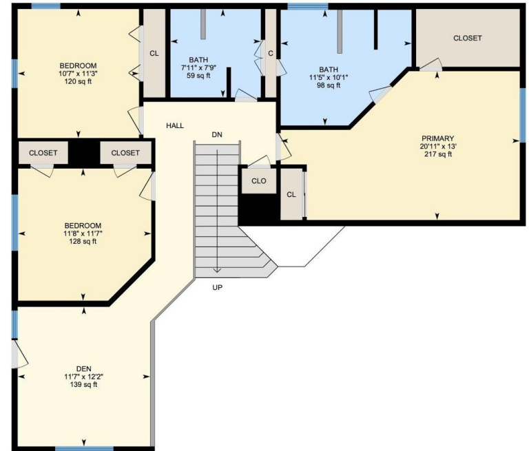
2nd Floor Exterior Area 1186.29 sq ft