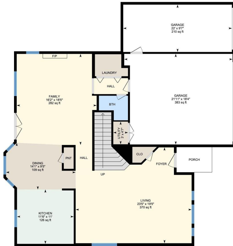
1st Floor Exterior Area 1185.64 sq ft