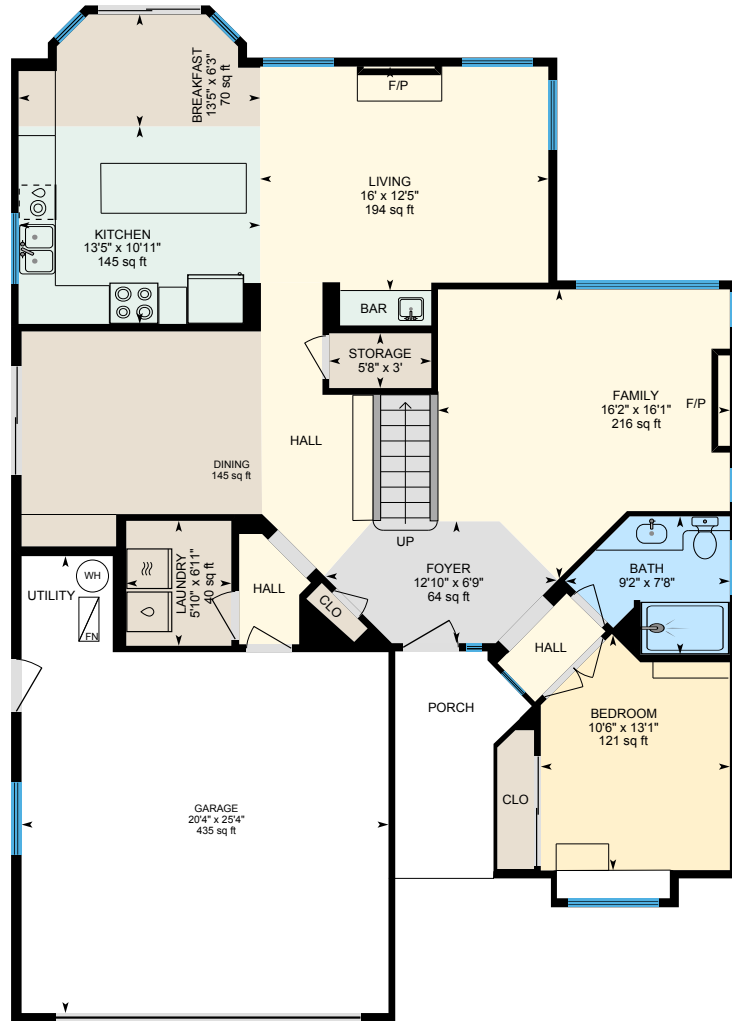
1st Floor Finished Area 1377.27 sq ft

Main Building: Above Grade Finished Area 2382.10 sq ft