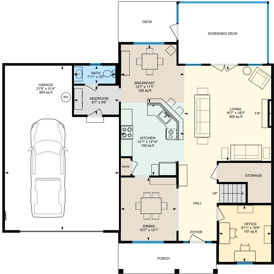
Main Floor Finished Area 1195.14 sq ft

Main Building: Above Grade Finished Area 2983.66 sq ft