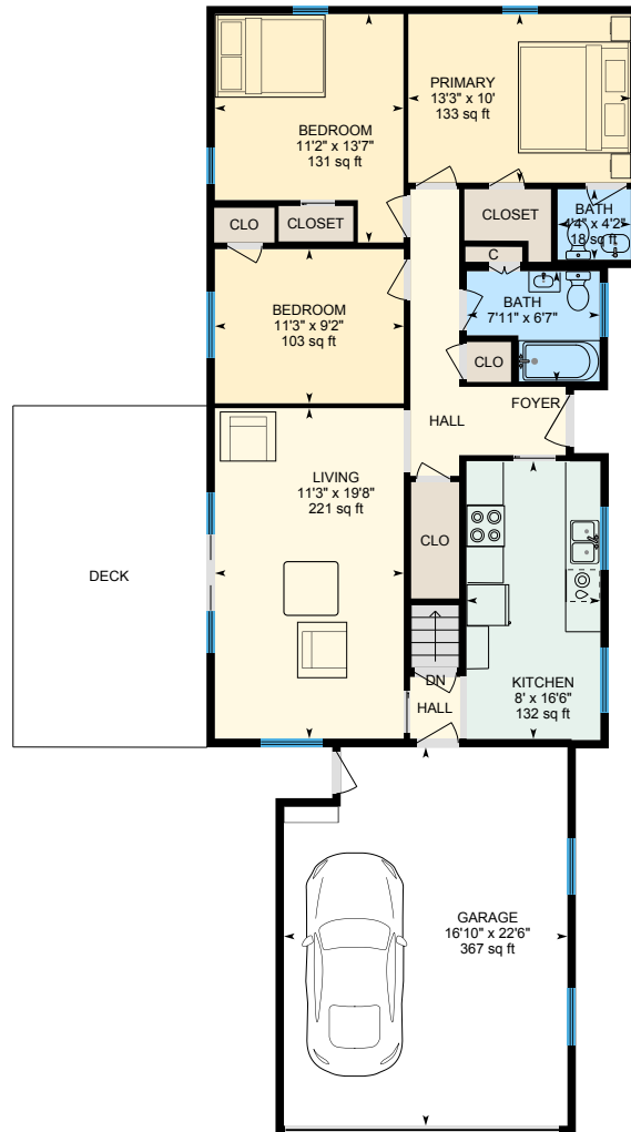
Main Floor Finished Area 1075.13 sq ft

Main Building: Above Grade Finished Area 1075.13 sq ft