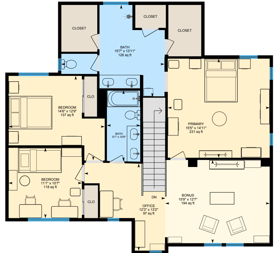
2nd Floor Finished Area 1261.14 sq ft