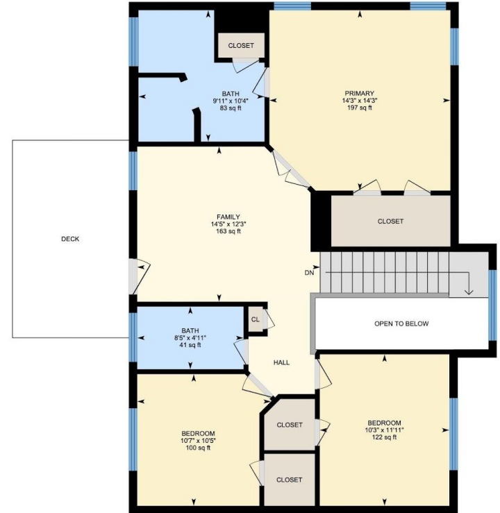
2nd Floor Exterior Area 1023.47 sq ft