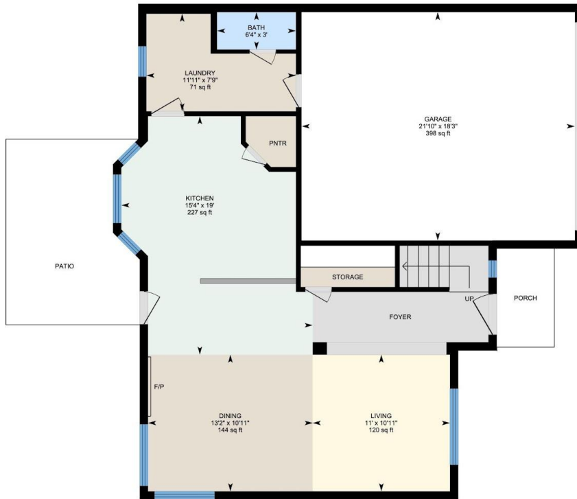
1st Floor Exterior Area 811.11 sq ft