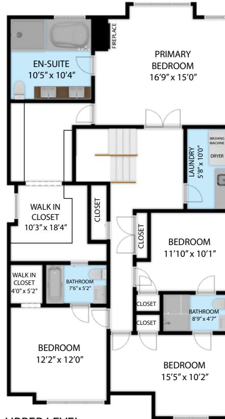
UPPER LEVEL 1,516 SQ.FT