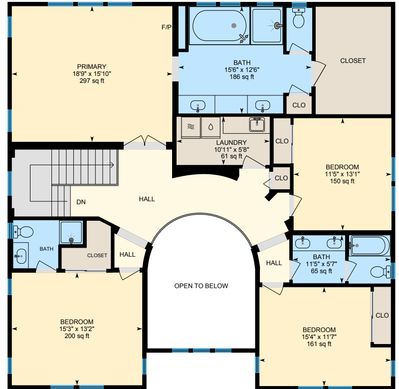
2nd Floor Finished Area 1808.47 sq ft