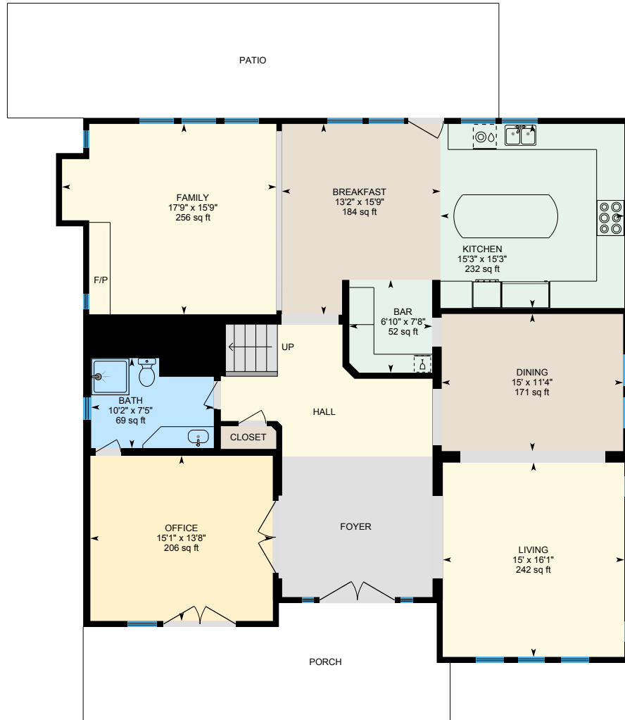
1st Floor Finished Area 1941.20 sq ft

Main Building: Above Grade Finished Area 3749.67 sq ft