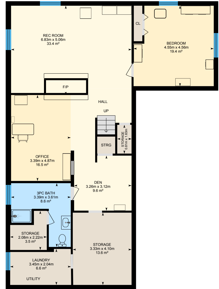
Basement (Below Grade) Exterior Area 143.50 m 2