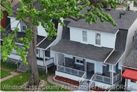
Top Drone Front Pic