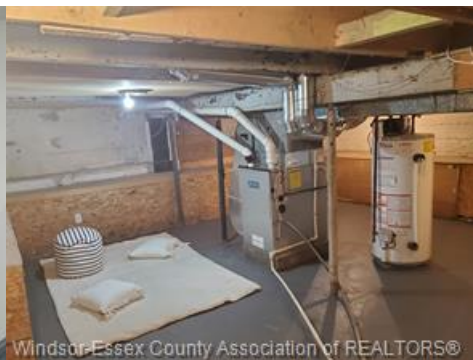
Lower Level for Children's Play Area.