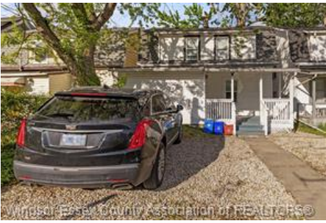
Rear House View