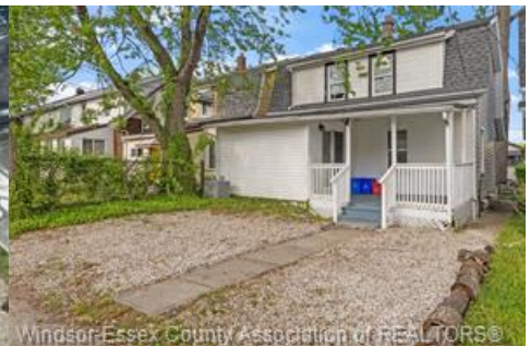
Graveled and wide for 2 vehicles