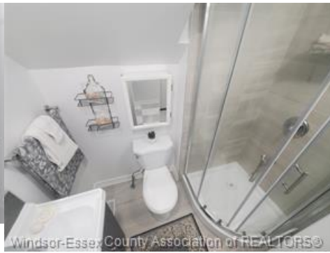
Main Floor 3 Piece Bathroom