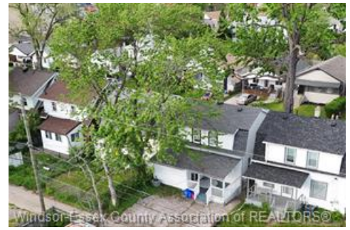
Drone Front Neighbourhood shot.