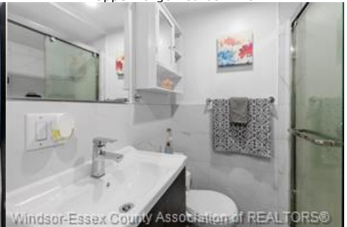
Upper 3 Piece Bathroom 4ft Shower Stall with sliding glass door.