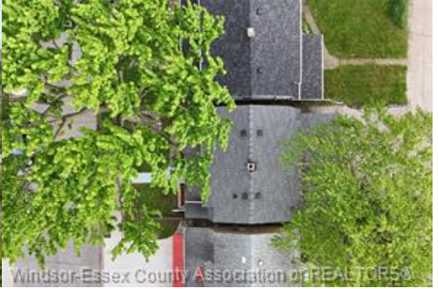
Top Drone Roof picture.