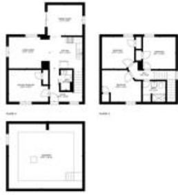
All 3 Levels