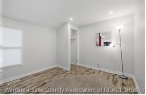
Upper Large Bedroom #3