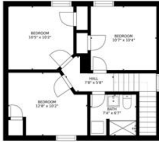
Upper Level Floor Plan