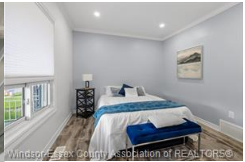
Large Front Main Floor Bedroom #1