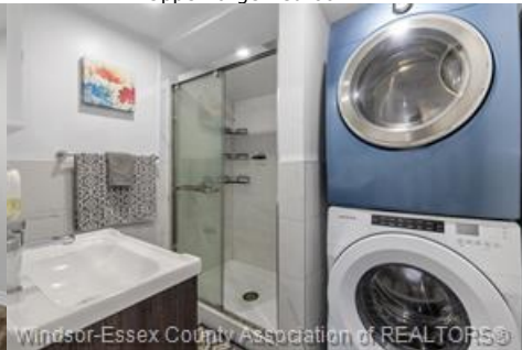
Upper Stacked W&D included