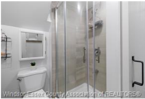
Barn Door to Main floor Bathroom