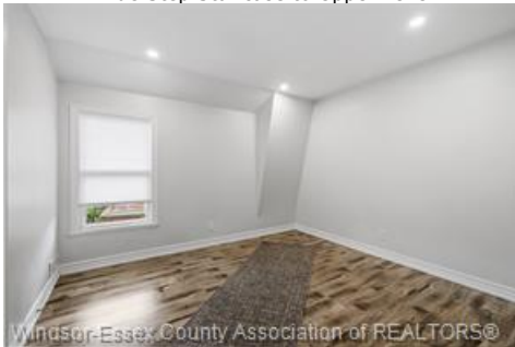
Upper Large Bedroom #4