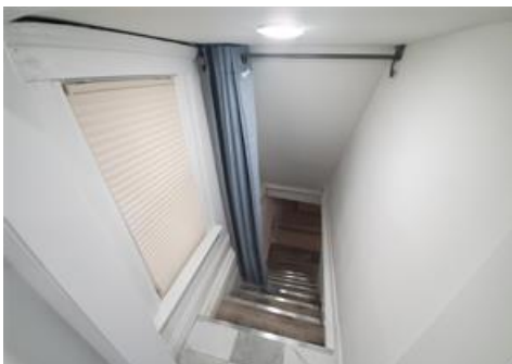
Chrome Bullnoses and finished steps leading to lower level