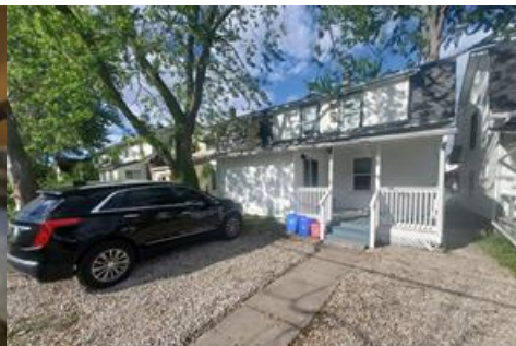
Easy access alley parking