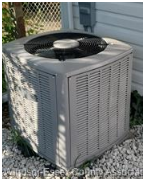
2021 AC, with warranty through MM-Mechanical.