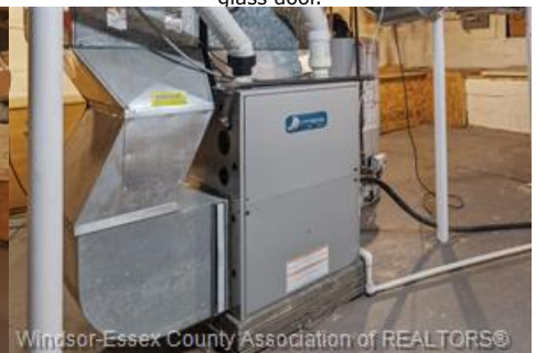
Solid Furnace and venting