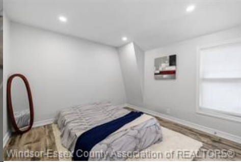
Upper large Bedroom #2