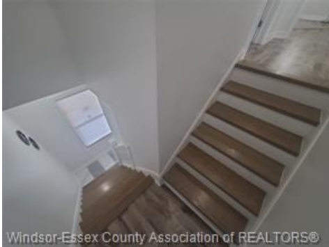
Wide Step Staircase to Upper Level