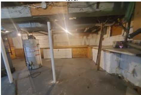
Lots of Lower Level Storage and work space