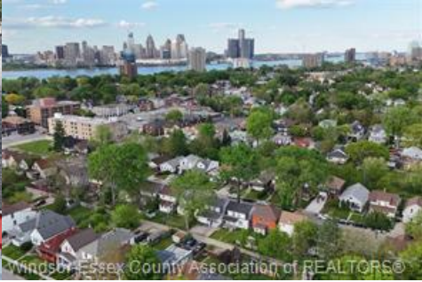
Close House Proximity to Riverfront