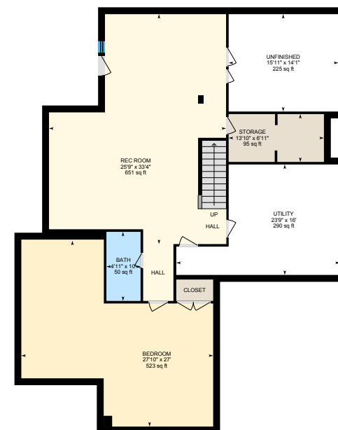
Basement (Below Grade) Finished Area 1646.13 sq ft