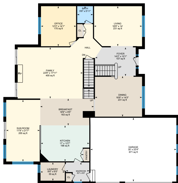
Main Floor Finished Area 2338.31 sq ft

Main Building: Above Grade Finished Area 4761.14 sq ft