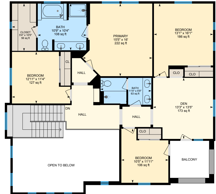
2nd Floor Finished Area 1481.13 sq ft