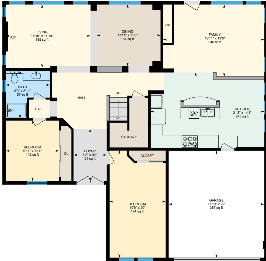
1st Floor Finished Area 1755.46 sq ft

Main Building: Above Grade Finished Area 2983.41 sq ft