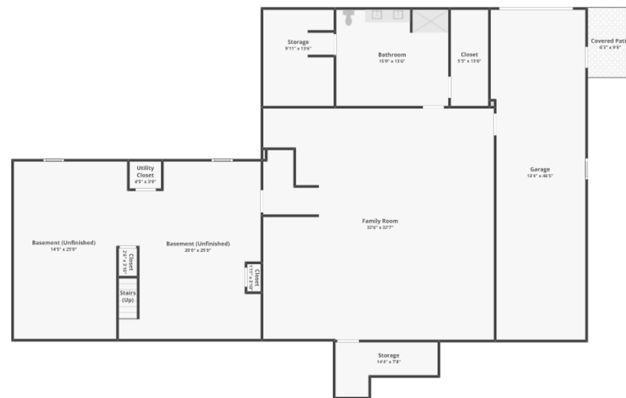
BASEMENT Finished area: ~1,541.18 sq. ft. Unfinished area: ~835.91 sq. ft.