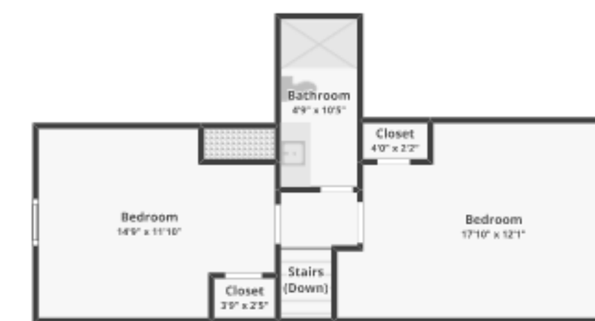
FLOOR 2 - A Finished area: ~440.58 sq. ft. Unfinished area: ~8.2 sq. ft.