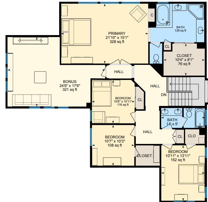
2nd Floor Finished Area 1784.60 sq ft