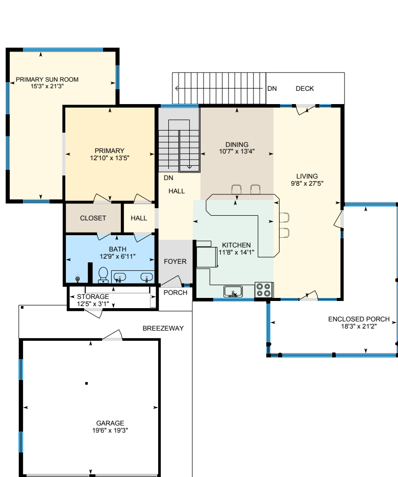
Main Floor Finished Area 1368.09 sq ft

Main Building: Above Grade Finished Area 2277.90 sq ft