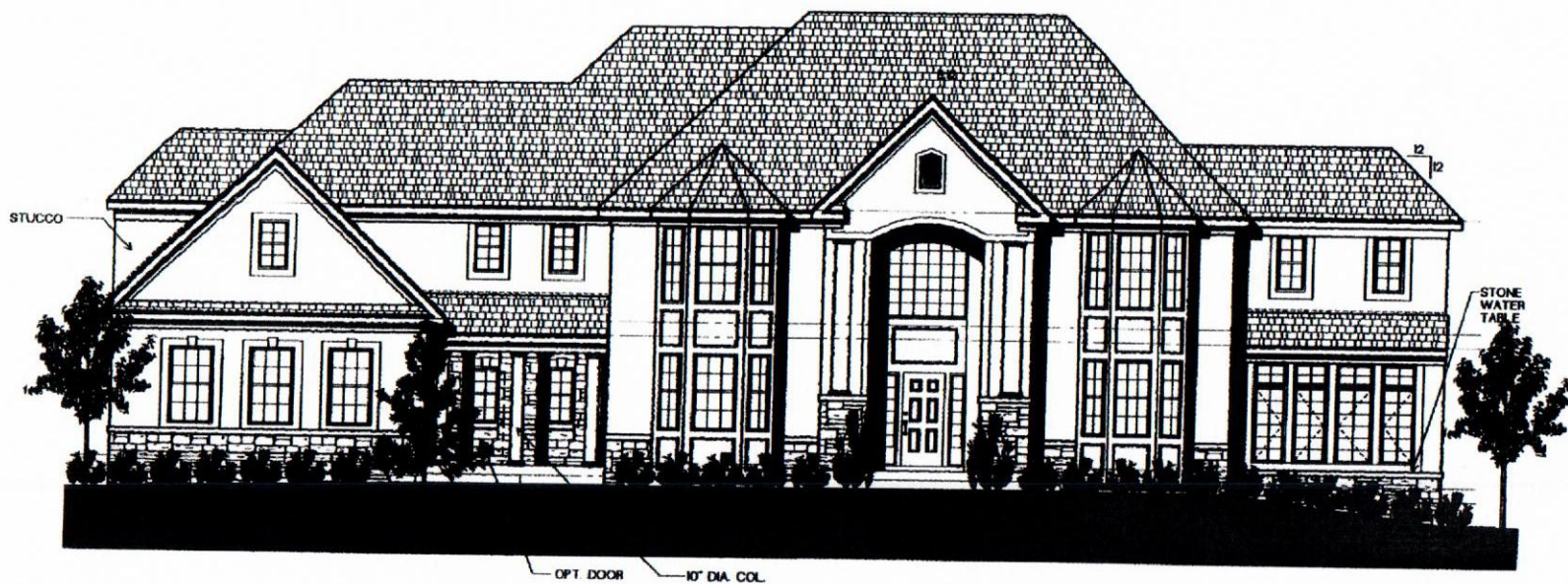
Front Elevation Scale: 1/8"=1'-0"

Note: All dimensions are approximate and subject to change without notice.