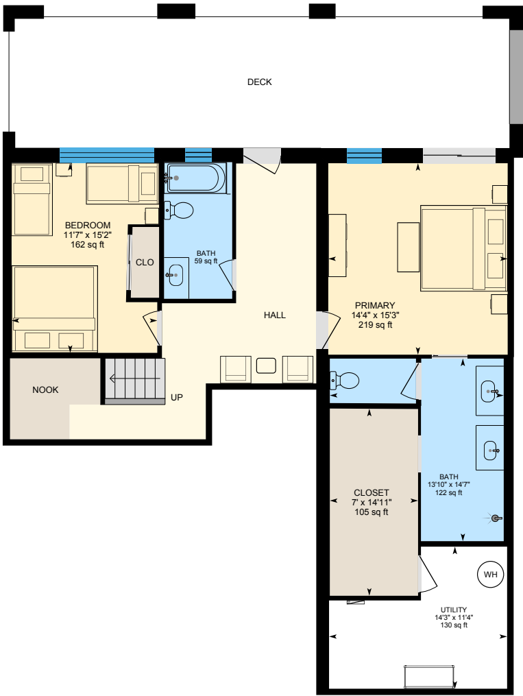
Lower Level Finished Area 1046.87 sq ft