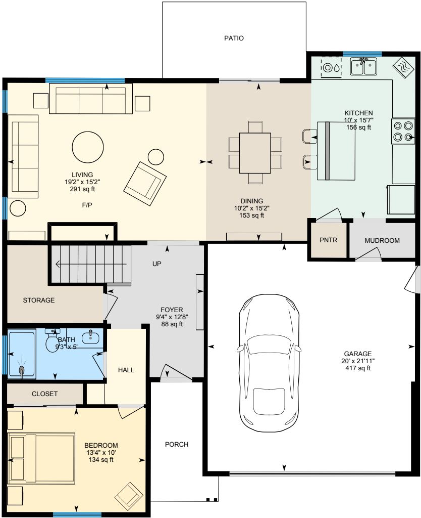
1st Floor Finished Area 1142.95 sq ft

Main Building: Above Grade Finished Area 2313.52 sq ft