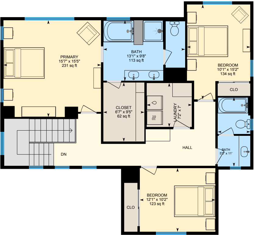
2nd Floor Finished Area 1170.57 sq ft