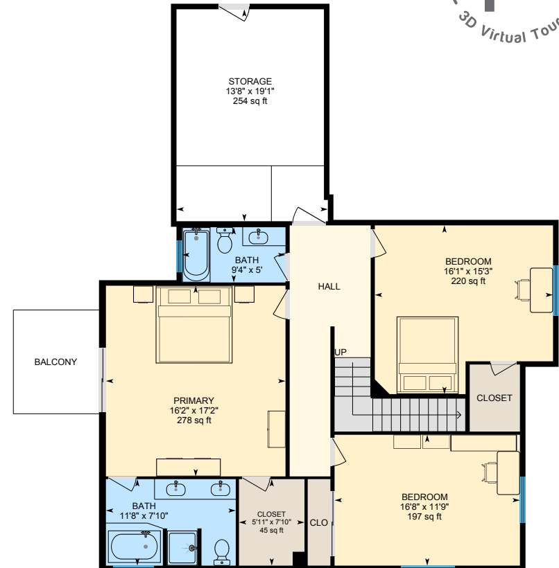
Lower Level Finished Area 1212.18 sq ft