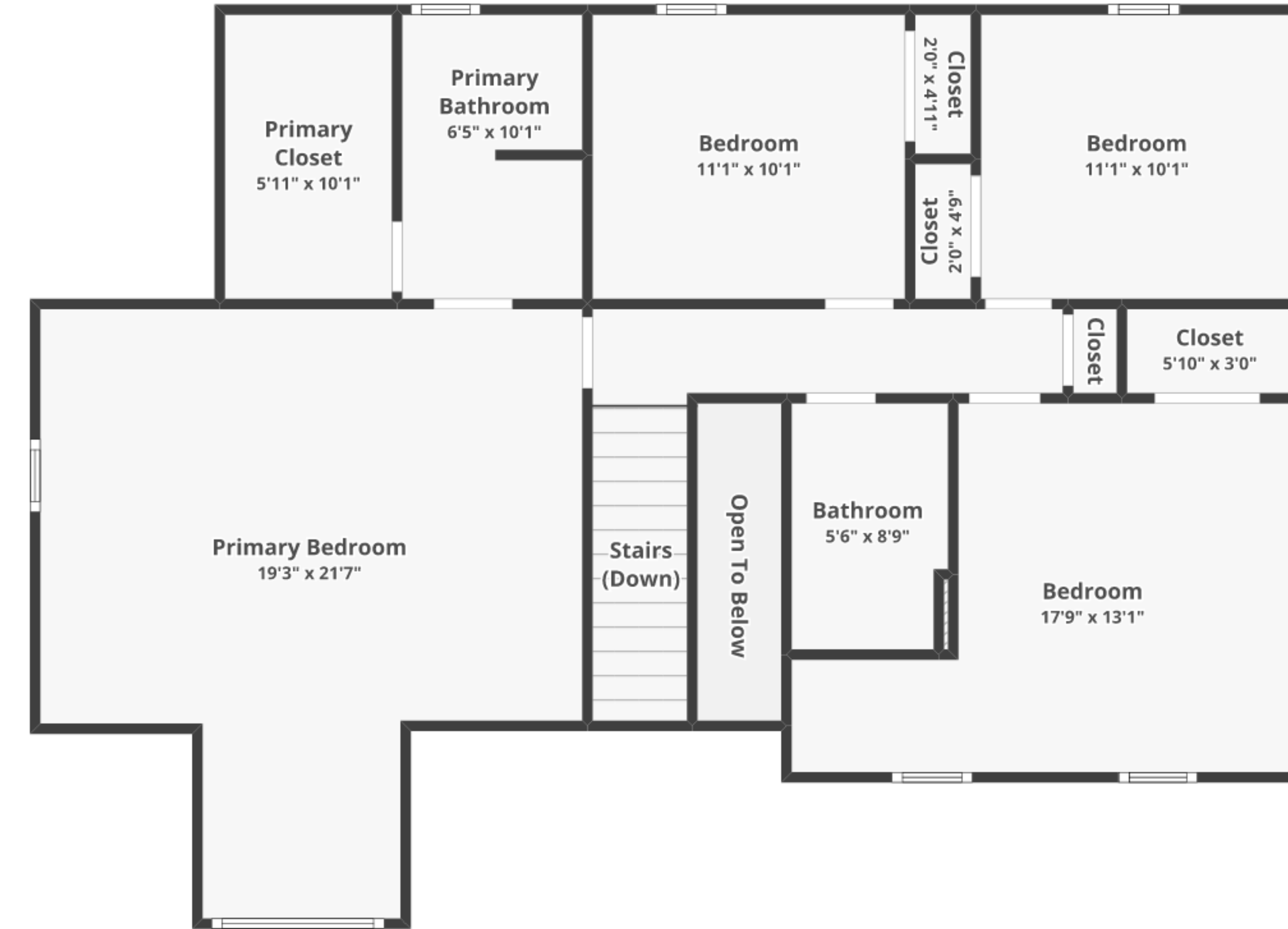
FLOOR 2 Finished area: ~1,030.27 sq. ft. Unfinished area: ~0.33 sq. ft.