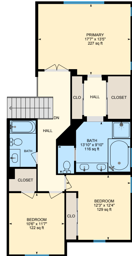
2nd Floor Finished Area 1032.08 sq ft