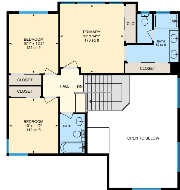
2nd Floor Finished Area 823.51 sq ft