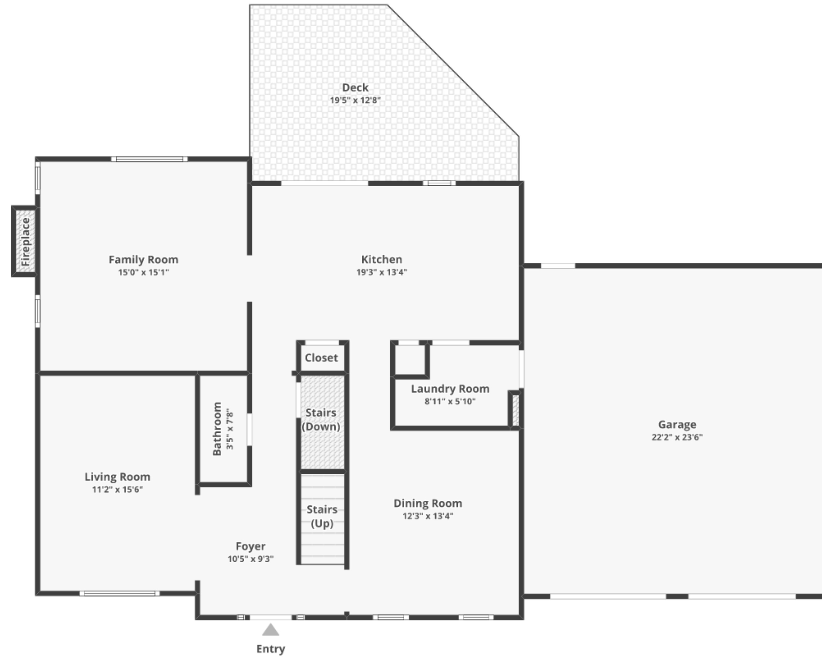
FLOOR 1 Finished area: ~1,028.86 sq. ft. Unfinished area: ~7.06 sq. ft.