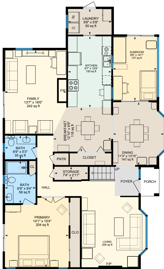
1st Floor Finished Area 1752.04 sq ft

Main Building: Above Grade Finished Area 2471.81 sq ft