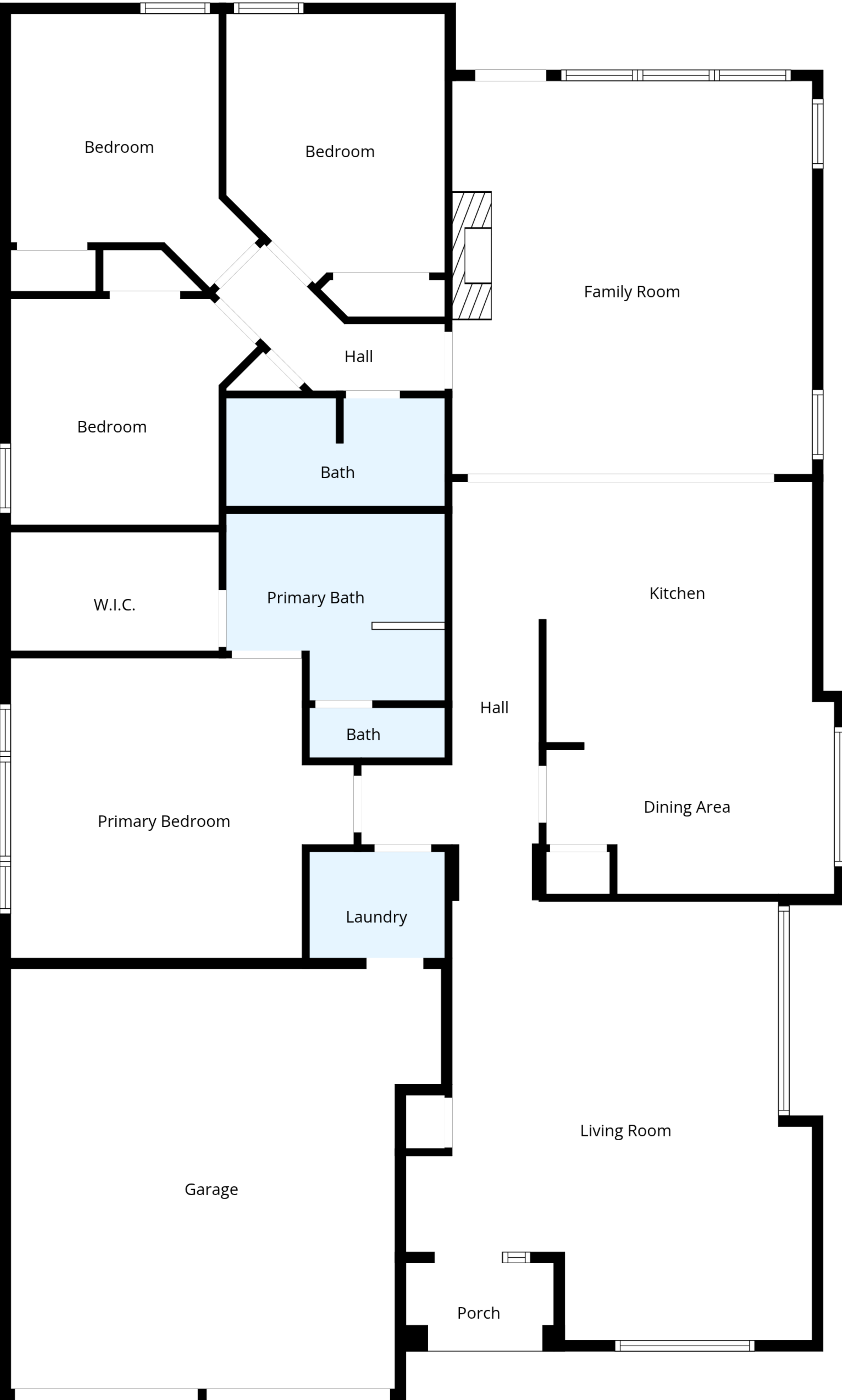
Measurements Are Approximate