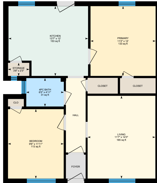
2nd Floor Exterior Area 832.94 sq ft