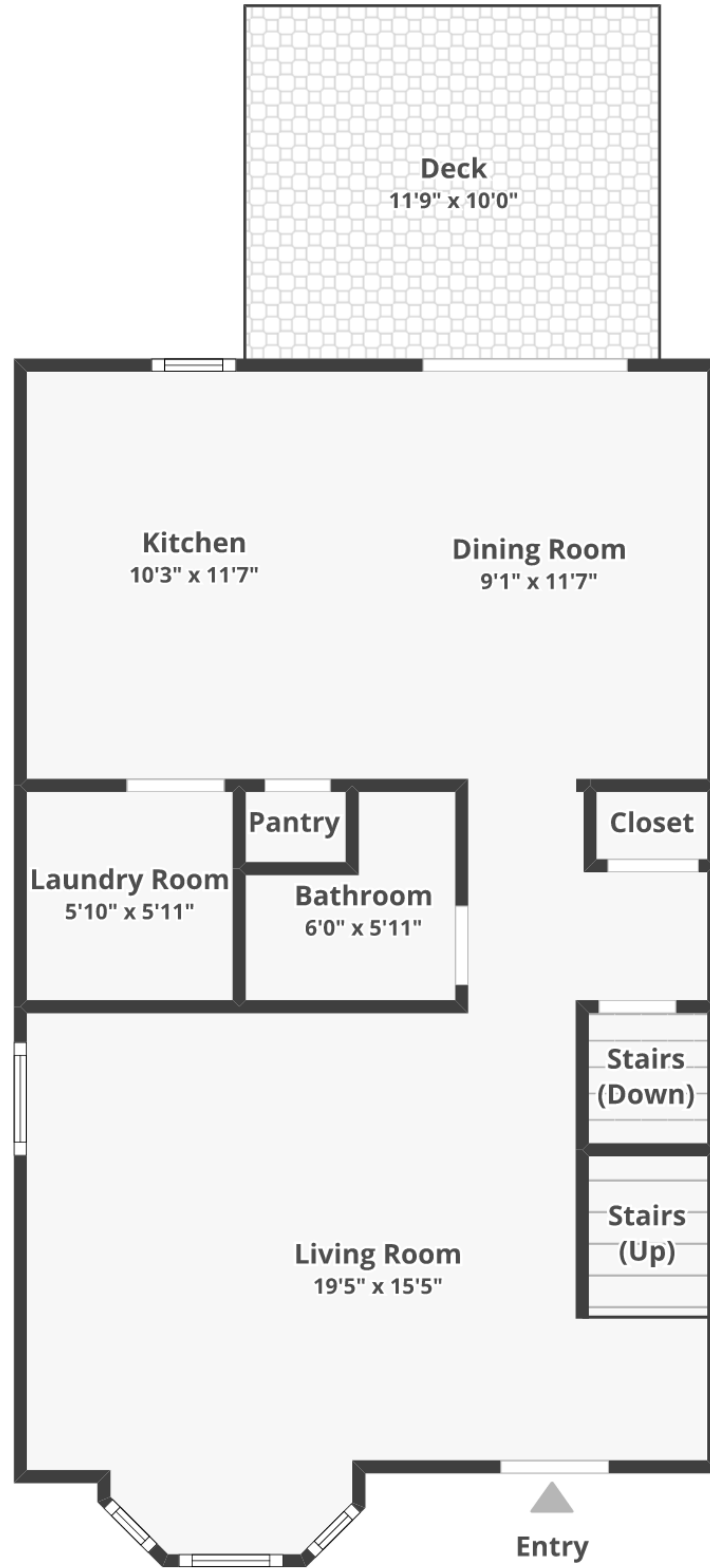
FLOOR 1 Finished area: ~578 sq. ft. Unfinished area: ~0 sq. ft.