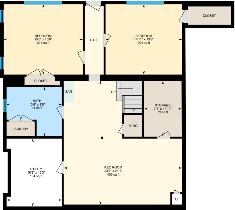
Lower Level (Below Grade) Finished Area 1323.94 sq ft