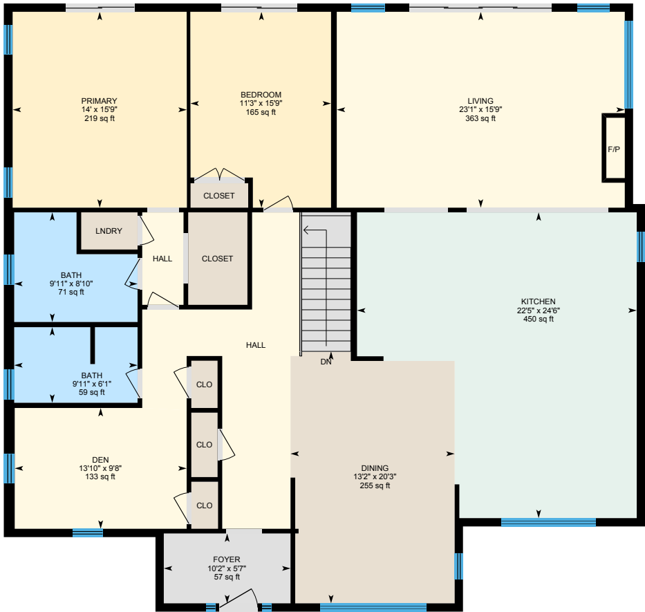
Main Level Finished Area 2315.42 sq ft

Main Building: Above Grade Finished Area 2315.42 sq ft